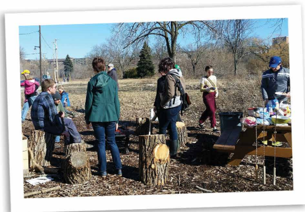
Roasted marshmallows anyone?

We say it every time, but this year's Woolly Bear was our best one yet! Thanks to everyone who came and we hope to see you next year.