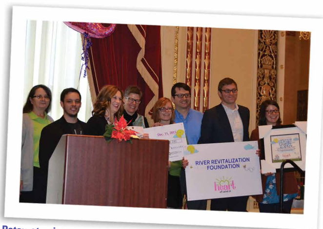
Potawatomi presents our check at the Kiwanis holiday party.

RRF received $31,051 in the random drawing to benefit our Student Stewards program! Staff enjoyed a celebratory evening and expresses our thanks to PHC for supporting us and all the other charities doing good work in the community.